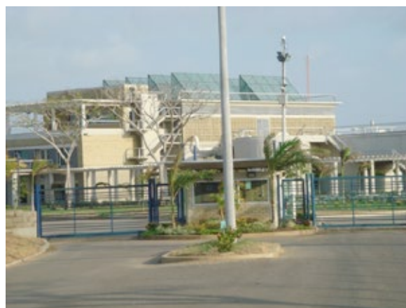
Figure 1: Photo of the Preliminary Treatment Plant of Cartagena, Colombia, Located Inside a Modern-Style Building, Posing no Nuisance to the Environment

The adoption of strategy (ii), which means operation of an on-land preliminary treatment plant contributes significantly to improving the sustainability of the utility in charge of wastewater management, in several forms: (a) by improving the financial sustainability of the utility due to reduced investment and reduced O&M costs of the wastewater management installations; (b) by improving the technical and operational sustainability of wastewater treatment installations through the use of a process simple to operate and maintain, based on simple equipment, mostly locally manufactured; and (c) by improving the institutional sustainability of the utility, since as a result of the limited economic demand and technical efforts required for operating the installations, which do not require significant managerial attention, wastewater management does not impose additional administrative efforts in the utility and therefore reduces the burden on the utility's management, thus improving its sustainability.