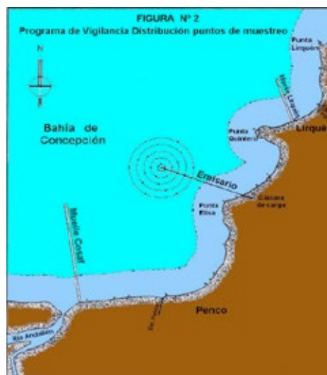
Figure 2: Sampling Points around the Penco Outfall

For all quality parameters measured around the Penco outfall, except fecal and total coliforms, concentrations at a distance of 100 meters from the discharge point are the same as background levels. This demonstrates the high treatment capacity of the outfall systems.